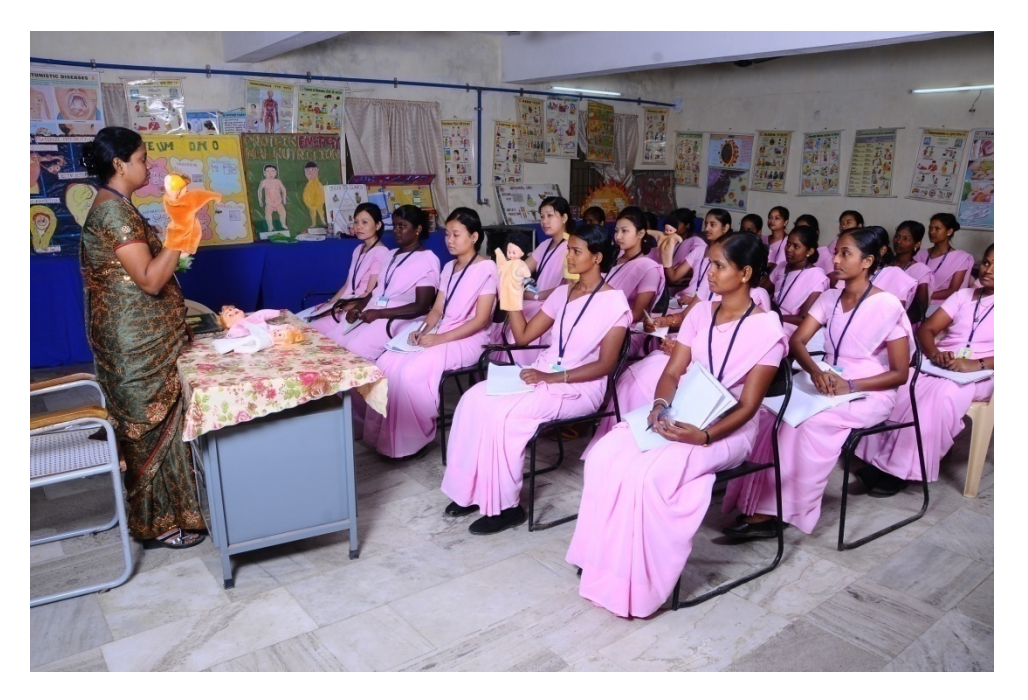
Branch-IV : Community Health Nursing